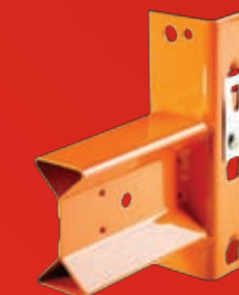
I-Beam. Don't pay for steel you don't need.