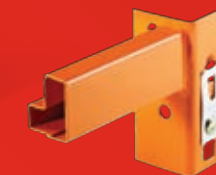
Stepped beam. Designed for longspan shelf storage.