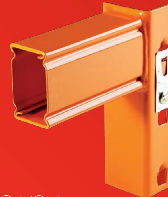
Box beam. The market leader.

Dexion provides you with more component choices.