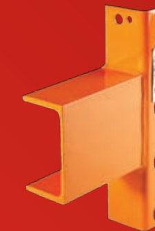
Channel beam. Excellent load carrying capacity and resistance to damage.