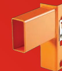
RHS beam. Excellent load carrying capacity and resistance to damage.