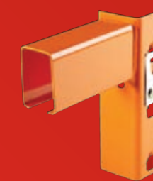
Open beam. For lighter loads.