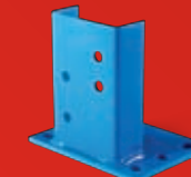
Narrow aisle baseplate.