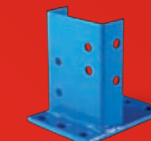
Heavy duty baseplate.